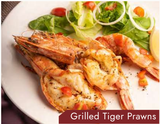
Grilled Tiger Prawns