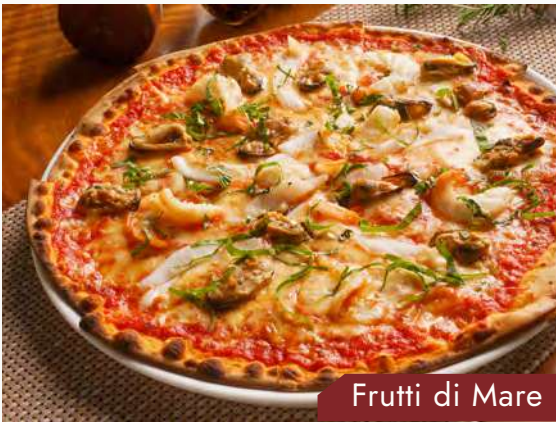
Frutti di Mare