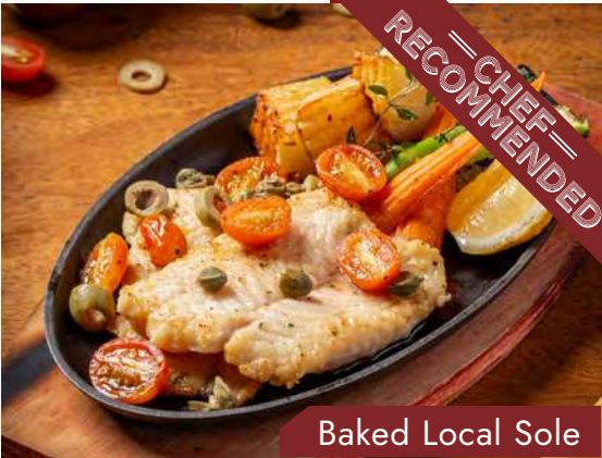
Baked Local Sole