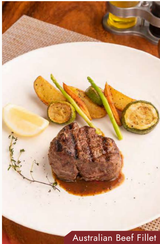
Australian Beef Fillet