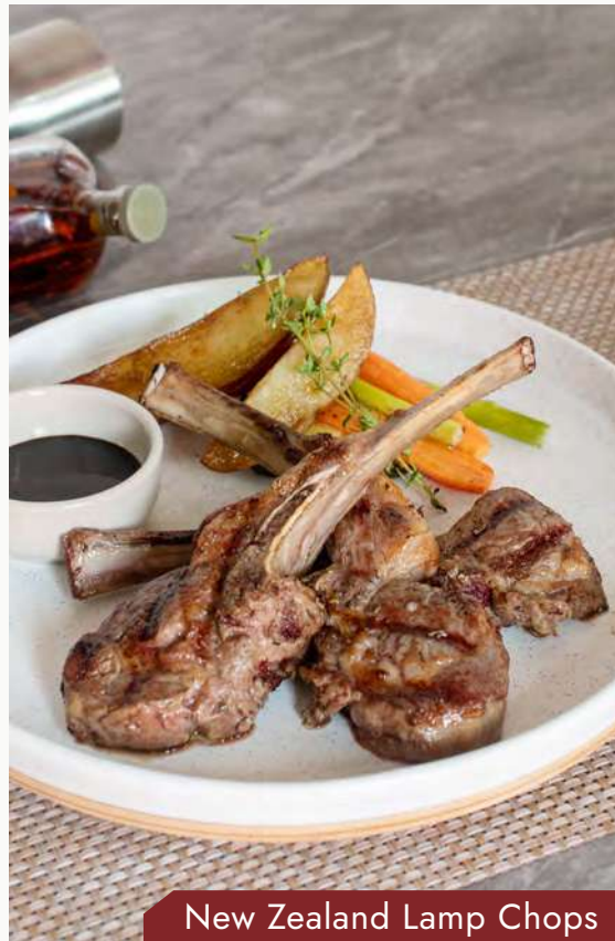
New Zealand Lamb Chops